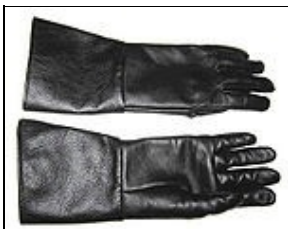
Black Gauntlet Gloves