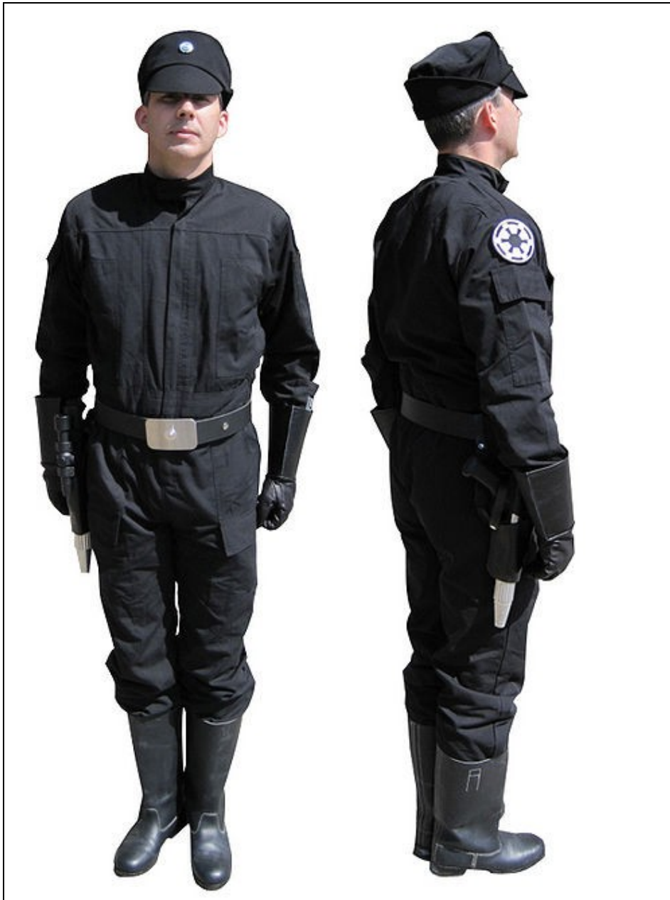
Model TI 8020