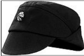
Imperial Hat, black For 501st approval:

The following costume components are present and appear as described below.