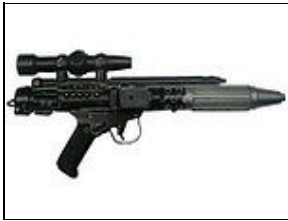
DH-17 Blaster For 501st approval:

Manufactured by BlasTech Industries, the DH-17 is a standard-issue Imperial sidearm for shipboard combat. The energy and power of the weapon are tuned to penetrate necessary targets, yet it will not puncture a starship's hull.