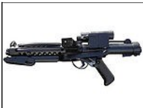
E-11 Blaster For 501st approval:

Manufactured by BlasTech Industries, the E-11 is standard-issue for many Imperial troops. Light, compact yet powerful, the E-11 blaster is always in high demand throughout the galaxy.