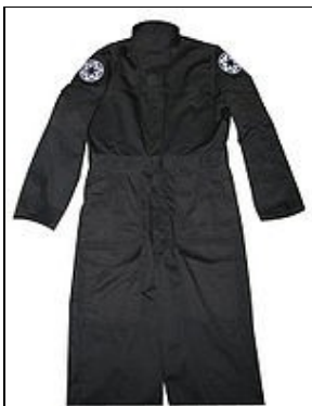
Black Imperial Flight Suit For 501st approval: