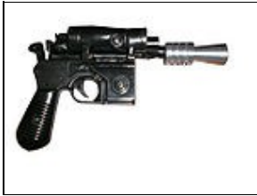
DL-44 Blaster Pistol For 501st approval:

Manufactured by BlasTech Industries, the DL-44 Blaster has the ability to charge a heavier blast, nearly twice as powerful as similar pistols. Because the sidearm is highly modifiable and is one of the few blasters shown to have the ability to penetrate imperial armor, the Empire has placed heavy restrictions on this model and in many cases ownership is outlawed outside of imperial forces.