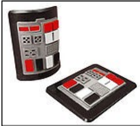
Imperial Communications Pad