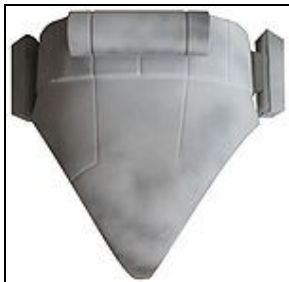
Posterior Armor, Belt rear and Detonator For 501st approval: