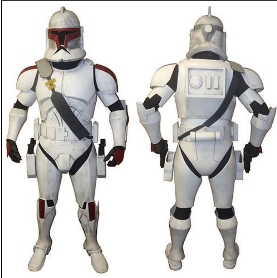
Model TC 5144