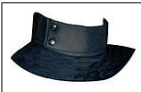
Neck Seal For 501st approval: