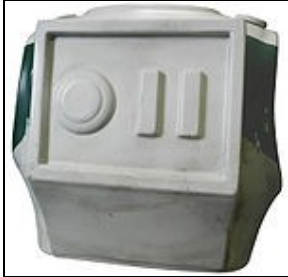
Back Armor For 501st approval: