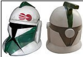
Helmet For 501st approval:

The following costume components are present and appear as described below.