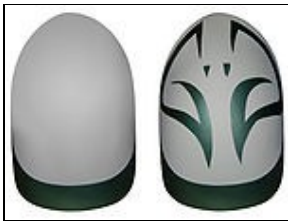
Shoulder Armor For 501st approval: