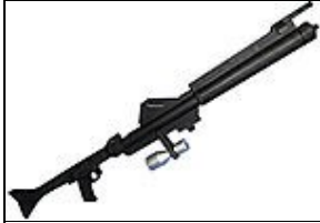
DC-15A Blaster Rifle (animated style) For 501st approval:

Manufactured by BlasTech Industries, this blaster is the standard issue weapon carried by the Clone Troopers of the Grand Army of the Republic.