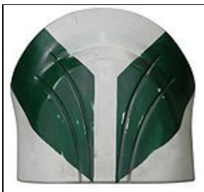
Abdomen Armor For 501st approval: