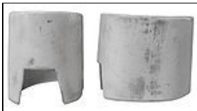
Upper Arm Armor For 501st approval: