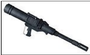
RPS-6 Rocket Launcher For 501st approval:

Manufactured by Merr-Sonn Munitions, Inc. , this portable rocket launcher is capable of penetrating ray shields and is primarily used as a anti-vehicle weapon.