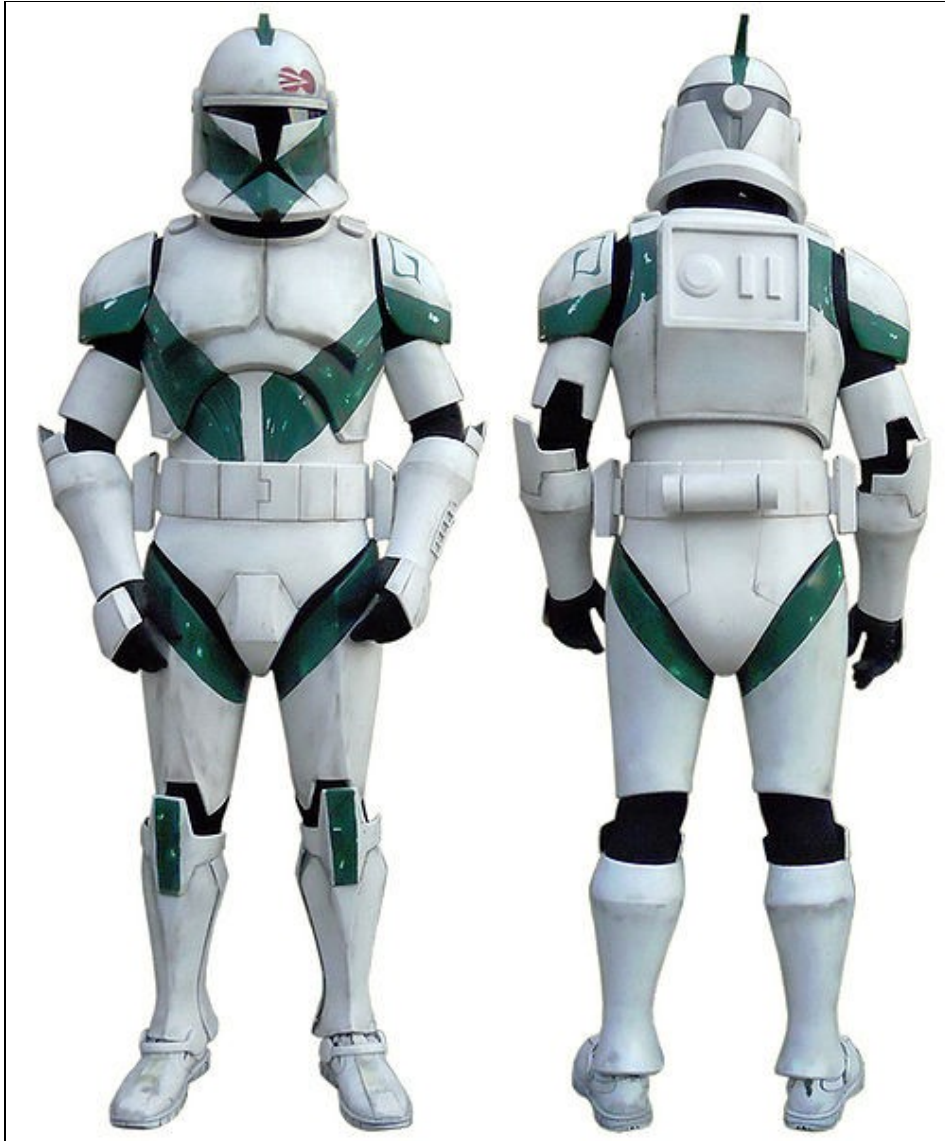
Model TC 5523