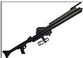
DC-15A Blaster Rifle (animated style) For 501st approval:

Manufactured by BlasTech Industries, this blaster is the standard issue weapon carried by the Clone Troopers of the Grand Army of the Republic.