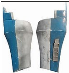
Forearm Armor For 501st approval: