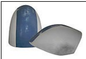
Shoulder Armor For 501st approval: