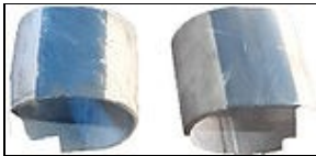
Upper Arm Armor For 501st approval: