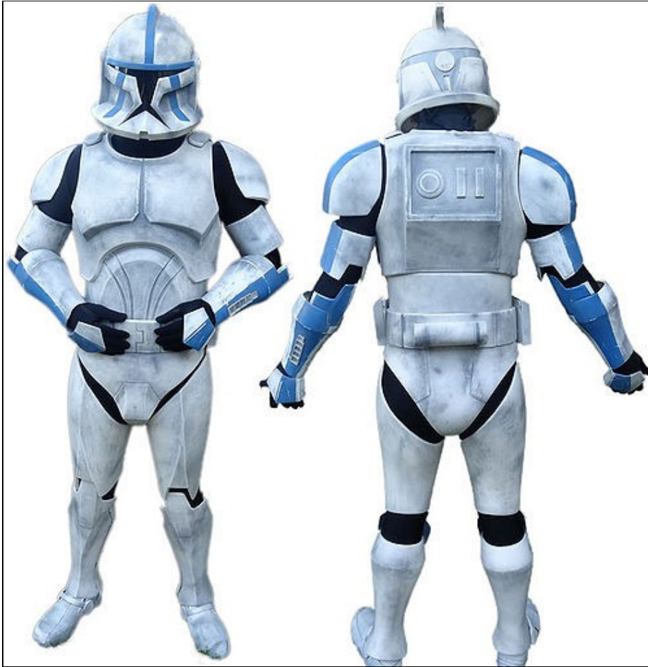
Model TC 8995