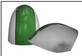
Shoulder Armor For 501st approval: