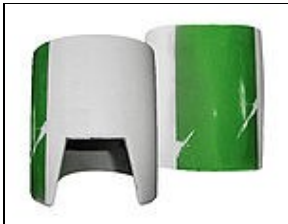
Upper Arm Armor For 501st approval: