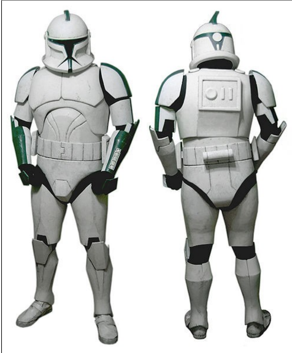
Model TC 7602