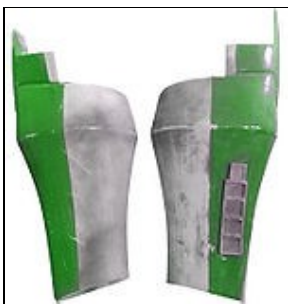
Forearm Armor For 501st approval: