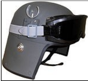
Helmet For 501st approval:

The following costume components are present and appear as described below.