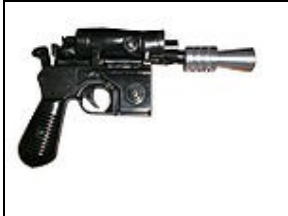
DL-44 Blaster Pistol For 501st approval:

Manufactured by BlasTech Industries, the DL-44 Blaster has the ability to charge a heavier blast, nearly twice as powerful as similar pistols. Because the sidearm is highly modifiable and is one of the few blasters shown to have the ability to penetrate imperial armor, the Empire has placed heavy restrictions on this model and in many cases ownership is outlawed outside of imperial forces.