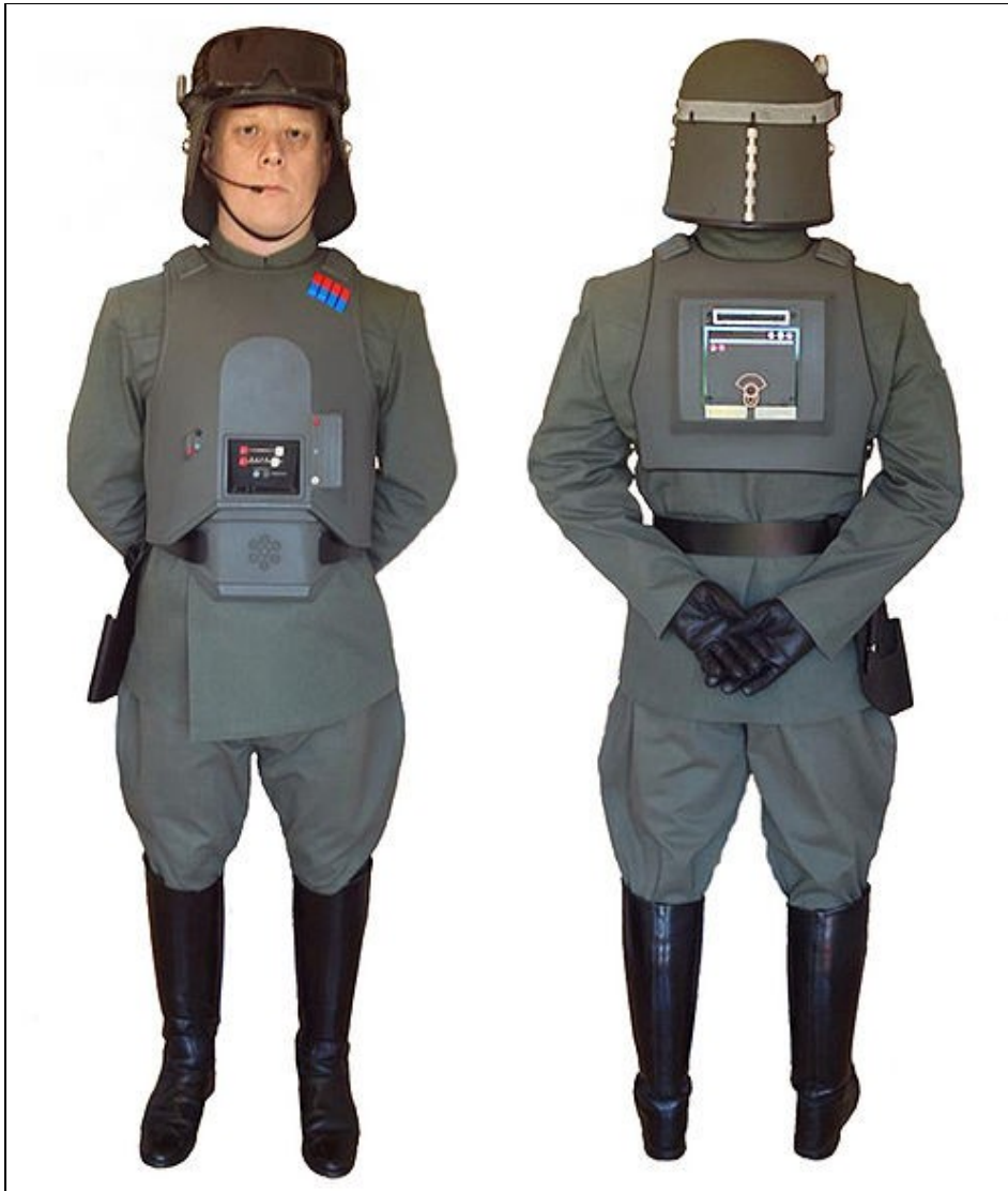
Model TA 5701