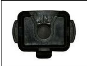
Lightsaber Clip For 501st approval: