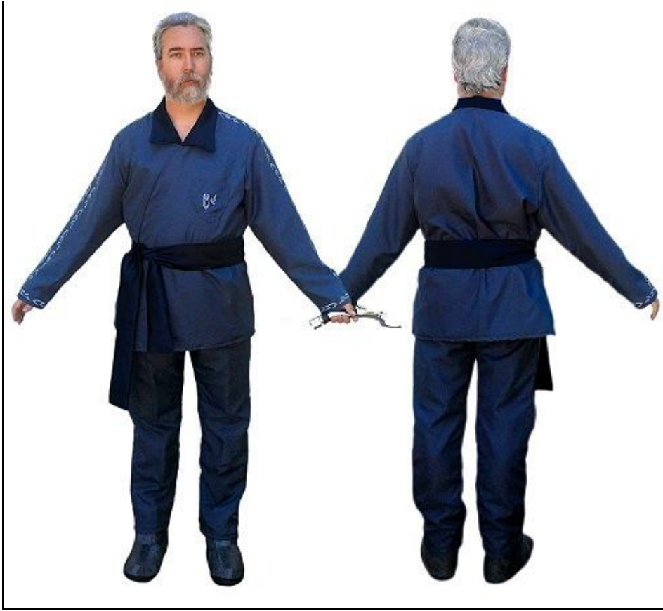
Model SL 9160