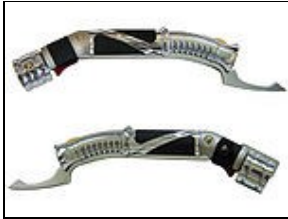
Lightsaber For 501st approval:

Items below are optional costume accessories. These items are not required for approval, but if present appear as described below.