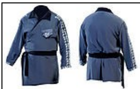
Tunic For 501st approval: