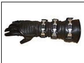
Glove For 501st approval: