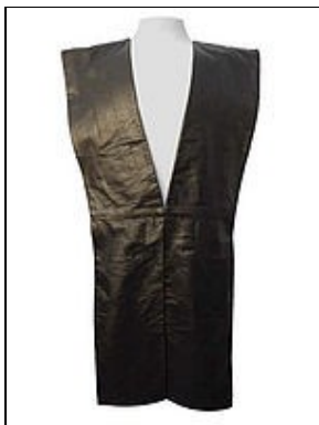
Leather Tabards For 501st approval: