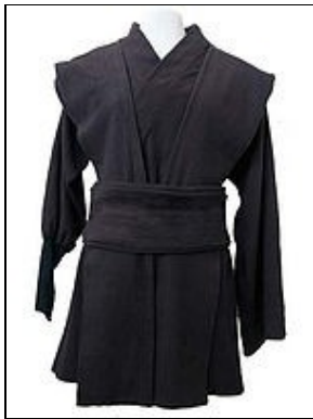
Cloth Tabards For 501st approval: