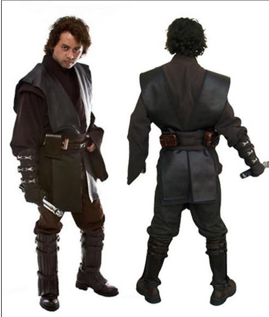
Model SL-2780 (front) / SL-7061 (back)