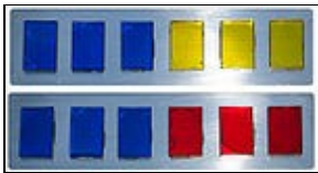
Grand Admiral Rank Bar For 501st approval: