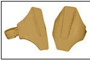
Knee Armor For 501st approval: