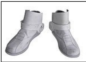
Boots For 501st approval: