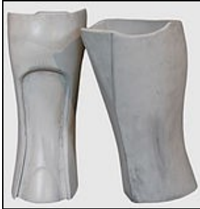
Lower Leg Armor For 501st approval: