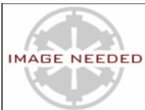
Abdomen Armor For 501st approval: