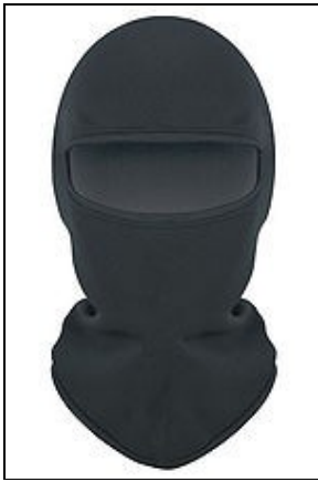
Neck Seal For 501st approval: