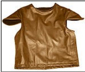
Flak Vest For 501st approval: