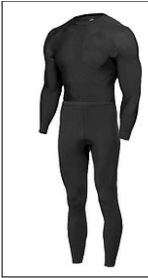
Under Suit For 501st approval: