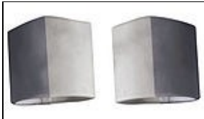
Upper Arm Armor For 501st approval: