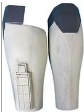
Forearm Armor For 501st approval: