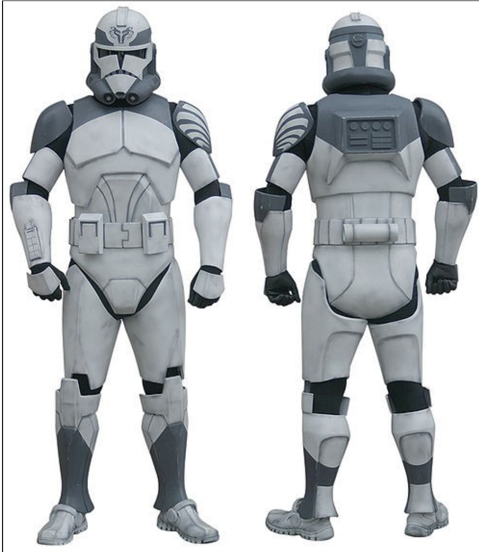
Model Sinker (Phase II)