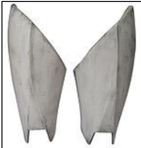
Thigh Armor For 501st approval: