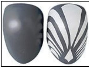
Shoulder Armor For 501st approval: