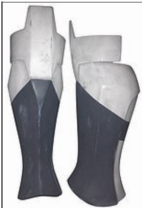
Lower Leg Armor For 501st approval: