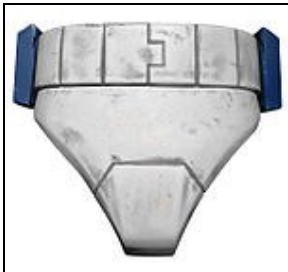
Codpiece and Belt front For 501st approval: