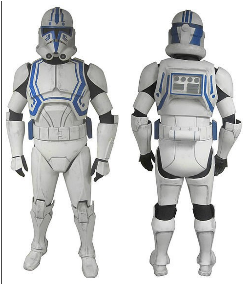
Model CT 9415