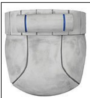
Posterior Armor, belt rear and detonator For 501st approval: