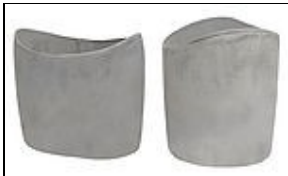
Upper Arm Armor For 501st approval: