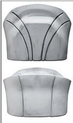
Abdomen Armor For 501st approval: