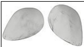
Shoulder Armor For 501st approval: