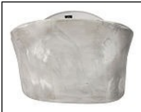
Kidney Armor For 501st approval: