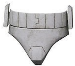
Codpiece and Belt front For 501st approval: