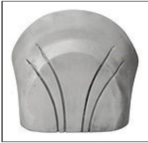
Abdomen Armor For 501st approval: