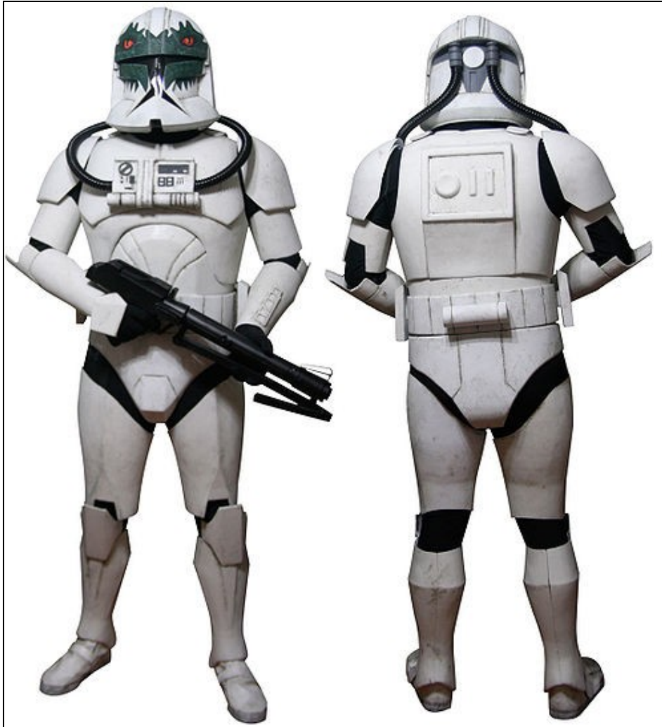
Model CP-7602