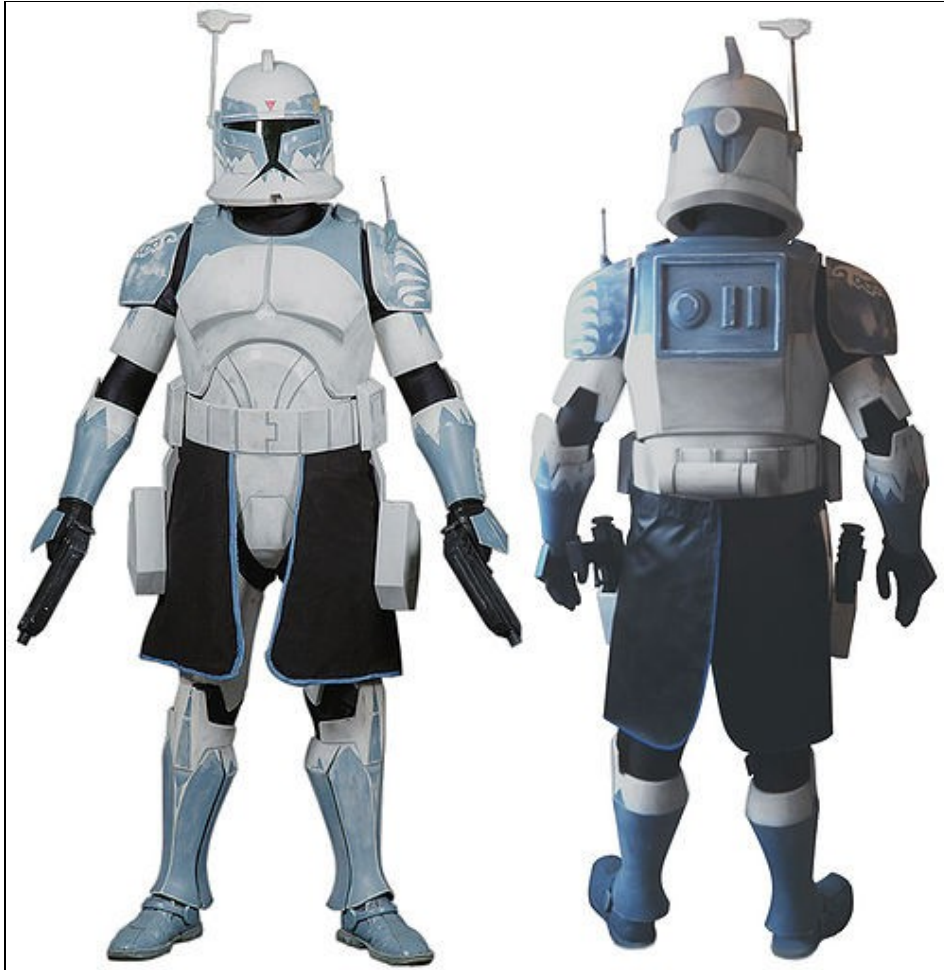
Model CC 128, Photo by Phil C.