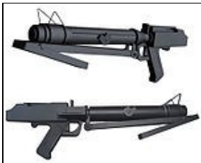
DC-15S Blaster Carbine (animated style) For 501st approval:

Manufactured by BlasTech Industries, this weapon is commonly carried by the Troopers of the Galactic Republic.