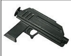
DC-17 Hand Blaster (animated style) For 501st approval:

Items below are optional costume accessories. These items are not required for approval, but if present appear as described below.