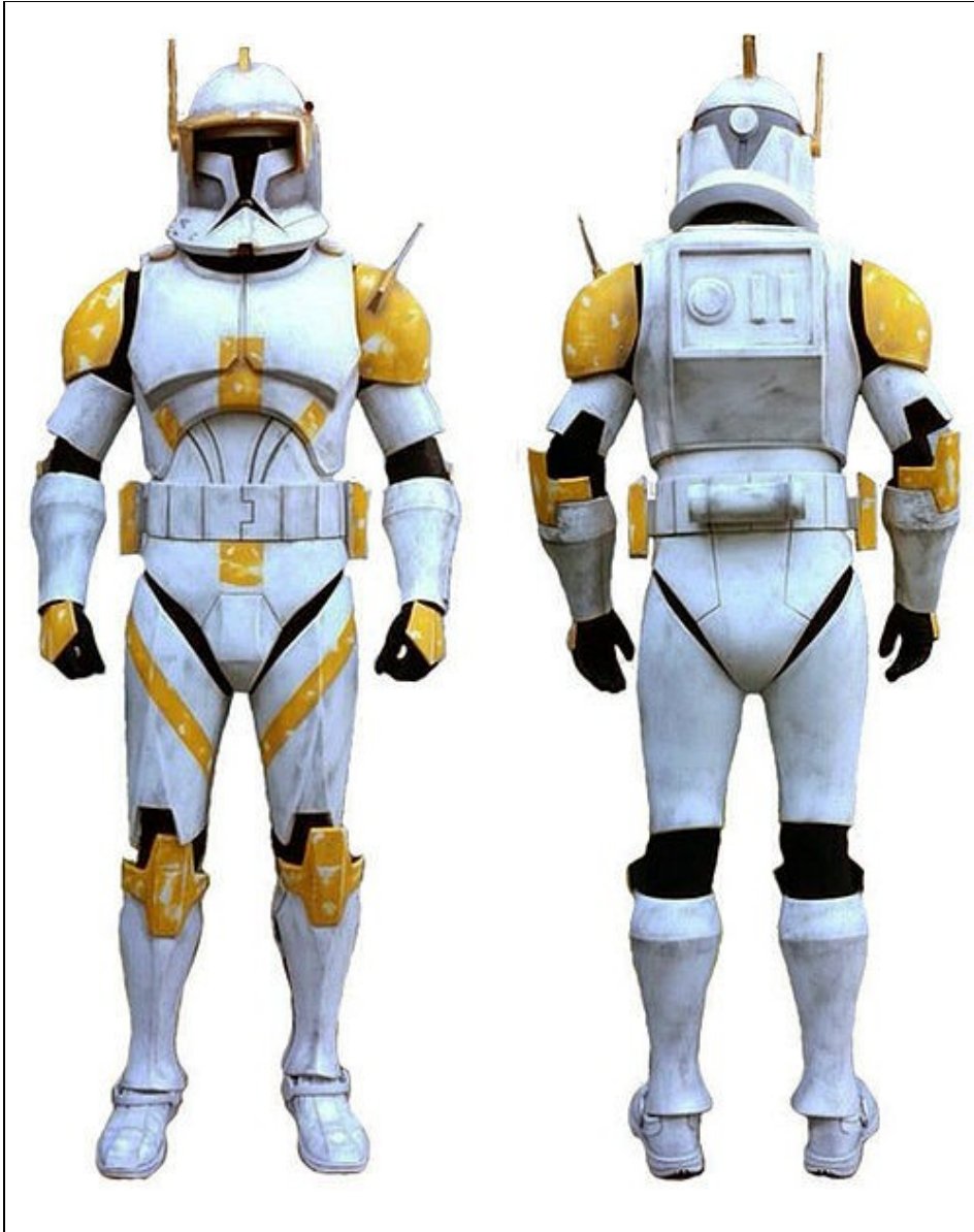
Model CC 9512