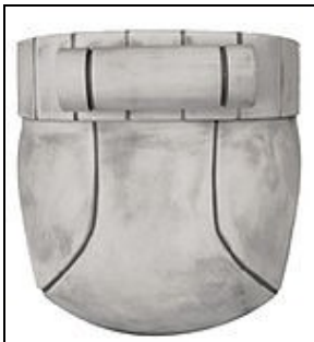
Posterior Armor, belt rear and Detonator For 501st approval: