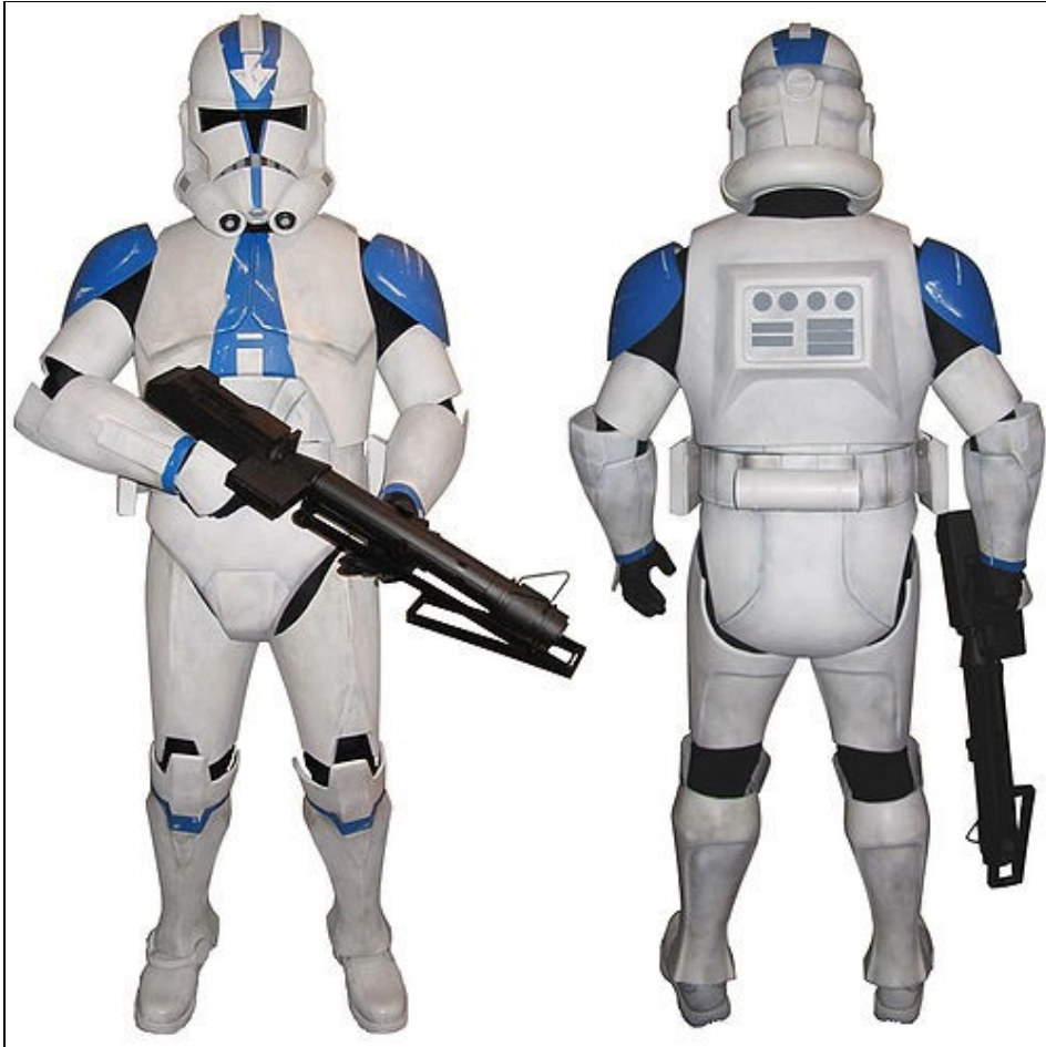
Model CC 2065