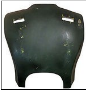
Back Armor For 501st approval: