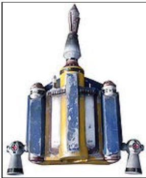
Jetpack For 501st approval:

For level three certification (if applicable):