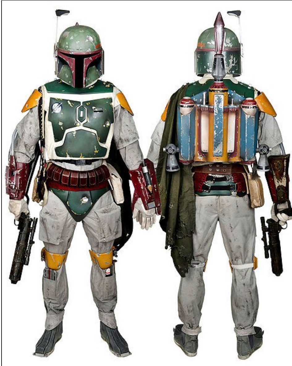
Model BH-6202 Oscar Lindh